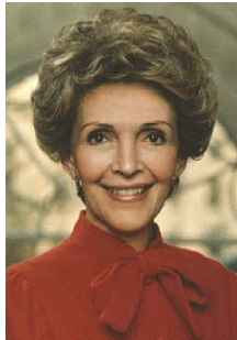
Nancy Reagan 1

Small illustrations with captions to the side: